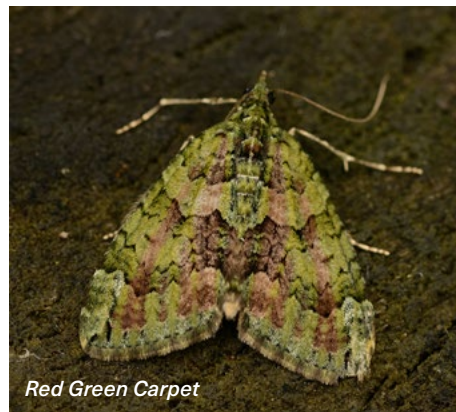
Red Green Carpet