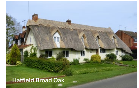
Hatfield Broad Oak