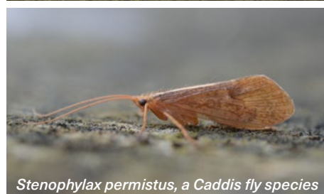
Stenophylax permistus , a Caddis fly species