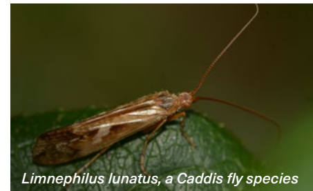
Limnephilus lunatus , a Caddis fly species