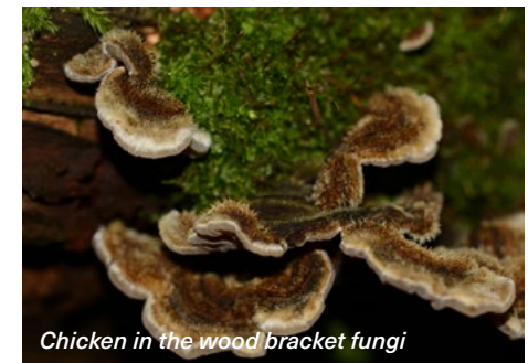
Chicken in the wood bracket fungi