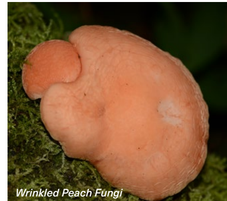
Wrinkled Peach Fungi