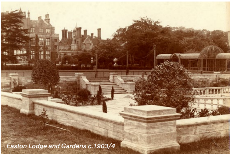
Easton Lodge and Gardens c.1903/4

volunteers' efforts will be to put the Gardens to bed for the winter and seasonal planting. The big departure will be to lift the dahlias to look after the tubers that survived the insatiable slugs and