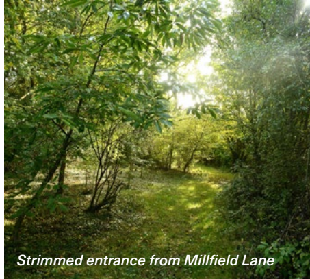
Strimmed entrance from Millfield Lane