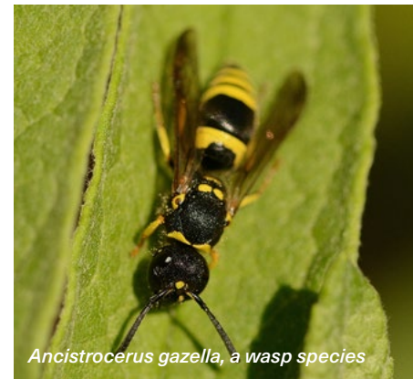
Ancistrocerus gazella , a wasp species