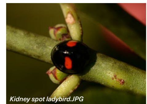
Kidney spot ladybird.JPG