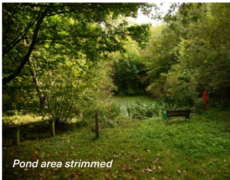
Pond area strimmed