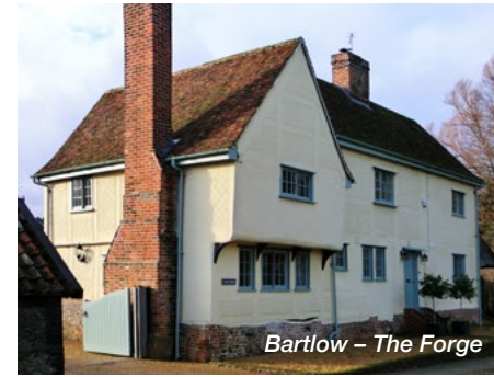
Bartlow – The Forge