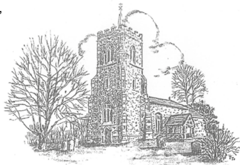
ST CECILIA'S CHURCH LITTLE HADHAM