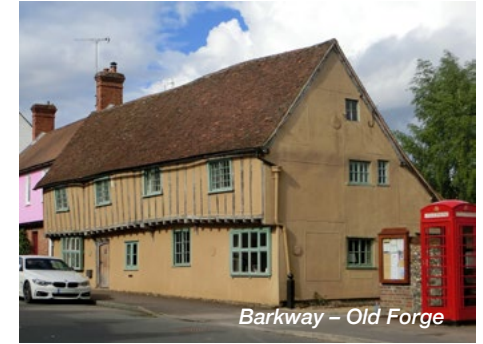
Barkway – Old Forge