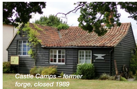
Castle Camps – former forge, closed 1989