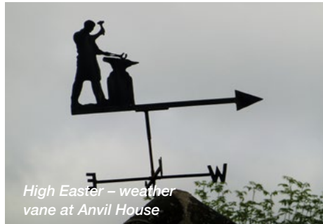
High Easter – weather vane at Anvil House