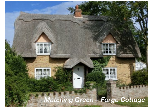
Matching Green – Forge Cottage