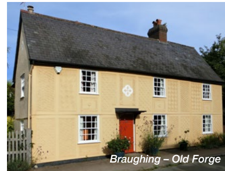
Braughing – Old Forge