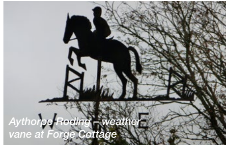
Aythorpe Riding – weather vane at Forge Cottage

Ashdon once had three blacksmiths in the village. Now, one of Ashdon Museum's excellent displays is a representation of a blacksmith's shop with all the tools and equipment that he would have used. The museum is open April to October from 2pm to 5pm on Sundays and bank holidays and is well worth a visit.