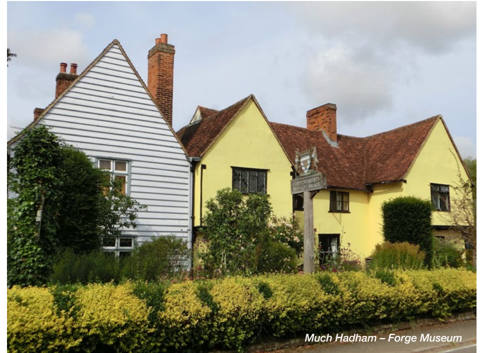
Much Hadham – Forge Museum